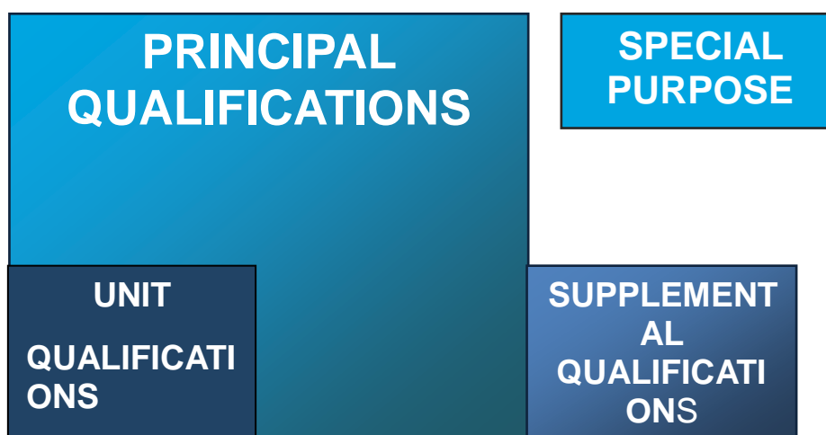
Figure 2 Relations among Qualification Categories

During TQF implementation, responsible bodies will define the categories of qualifications with different purposes and functions in qualification type specifications.